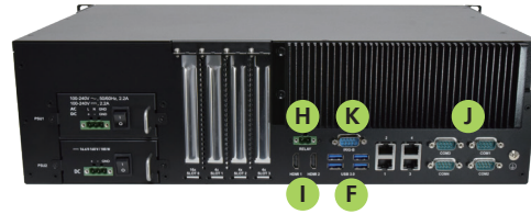
Front side by SKU E - G