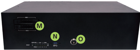
Rear side by SKU A - G